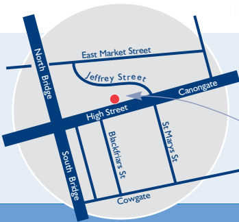
The Scottish Storytelling Centre and John Knox House